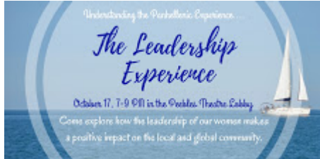
The Leadership Experience 357K