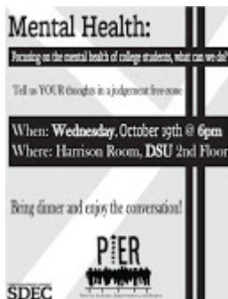
Pier Perspective 756K