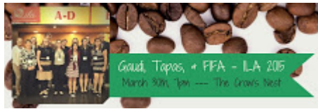
ILA Coffeehouse 105K