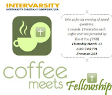
Coffee Meets Fellowship 263K