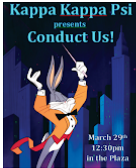
Conduct Us 469K