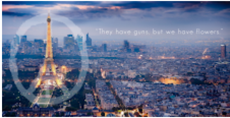
I'm on a Terrace 9584K