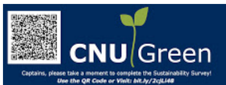
CNU Green Survey 61K