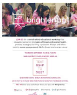
Bright Pink Workshop 535K