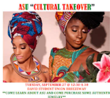
Cultural Takeover.png 479K