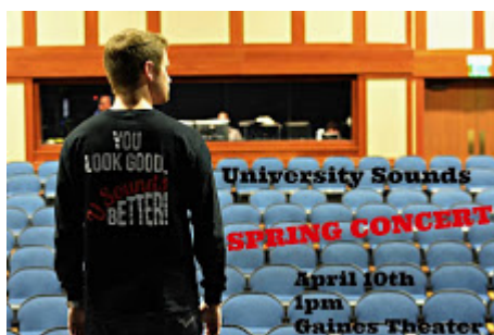
U Sounds 73K