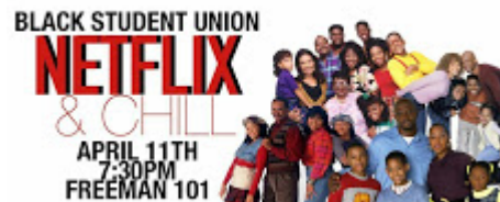
BSU Netflix and Chill 110K