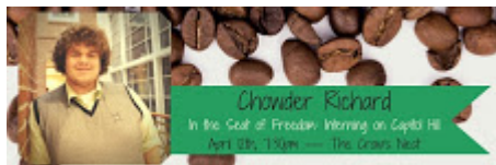
PLP Coffeehouse 104K