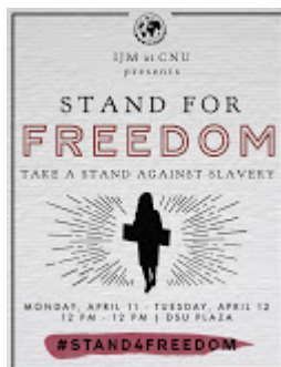
Stand for Freedom 299K