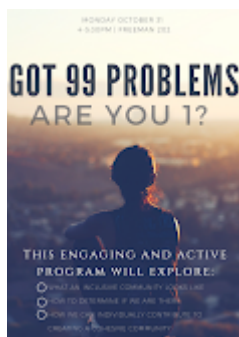
Got 99 Problems 3012K