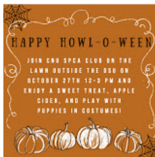
SPCA Club 263K