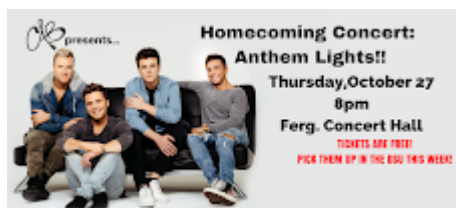
CAB presents... Anthem Lights 557K