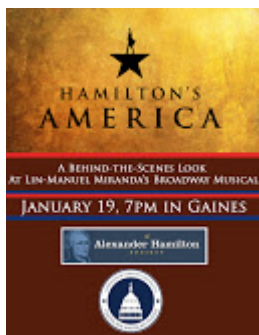
CAS Hamilton.jpg 4096K