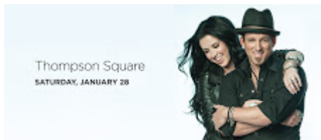
Thompson Square.jpg 82K