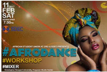
Afrodance Workshop.JPG 1357K