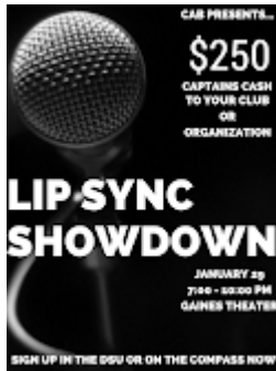
CAB Lip Sync 1486K

Follow us on Twitter @CNUOSA or like the CNU Office of Student Activities on Facebook!