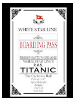
Captain's Ball 120K