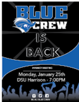
Blue Crew 530K