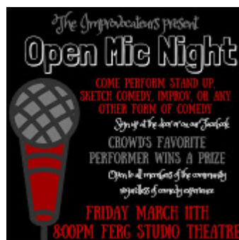
Open Mic Night 288K