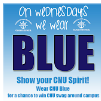
We Wear Blue 179K