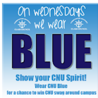
We Wear Blue 179K