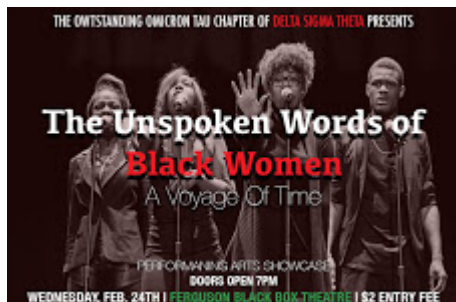
Delta Sigma Theta: The Unspoken Words of Black Women 127K