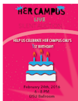
Her Campus 742K