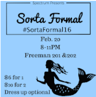
Spectrums Sorta Formal 193K