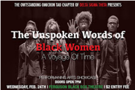
Delta Sigma Theta: The Unspoken Words of Black Women 127K