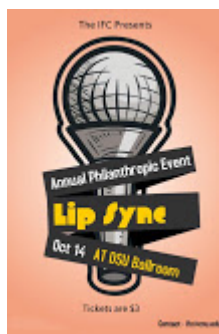
IFC LipSync.jpg 53K