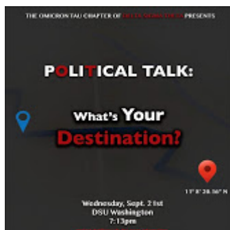
Political Talk 40K