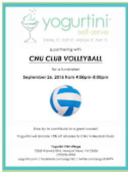
Volleyball Fundraiser.png 246K