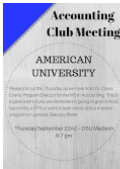
Accounting Club 219K