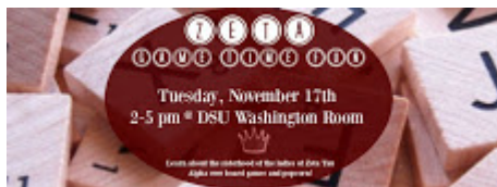
ZTA Game Time 77K