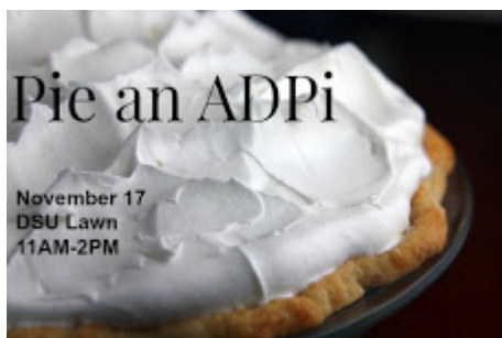
Pie an ADPi 37K