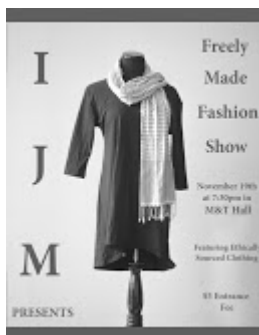
Freely Made Fashion Show 2050K