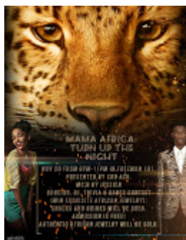
African Student Union Events 1525K