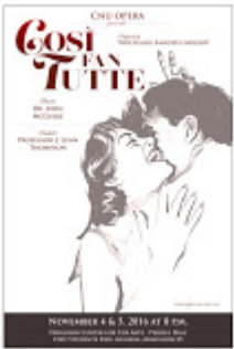
Opera CNU 74K