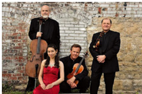
Amara Piano Quartet 91K