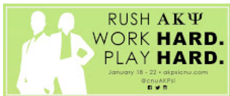
Alpha Kappa Psi 88K