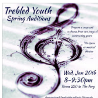
Trebled Youth 110K