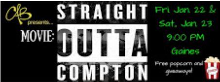
CAB Strait outta compton 95K