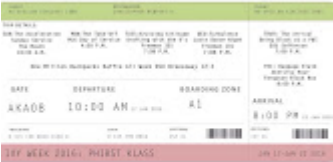
Alpha Kappa Alpha Ivy Week 48K