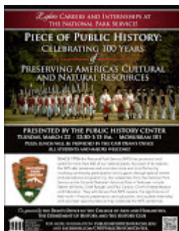
National Park Service 460K