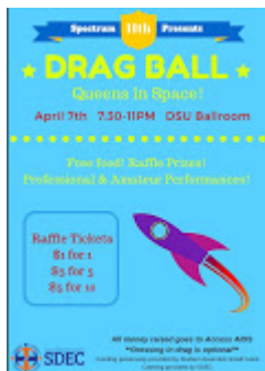
Drag Ball 149K