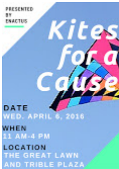
Kites for a Cause 1013K