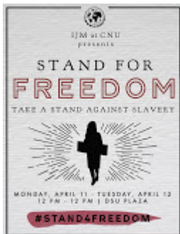
Stand for Freedom 299K