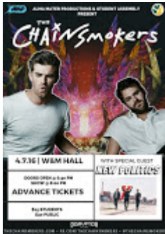
The Chainsmokers 134K