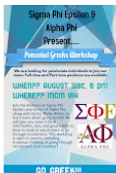
Potential Greek Workshop 595K