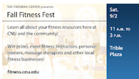
Fall Fitness Fair 382K