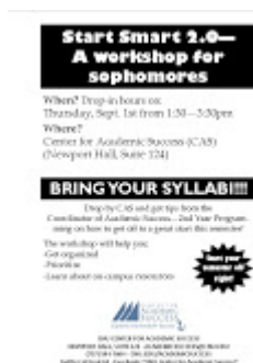
Start Smart 2.0 87K