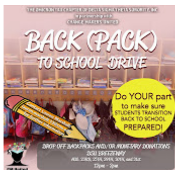
Delta Sigma Theta Back to school drive 259K