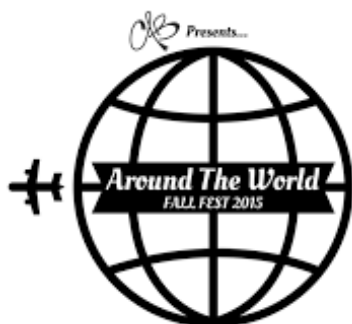
CAB_Fall Fest 2015.png 79K