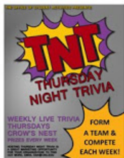
TNT Trivia_general.jpg 18K