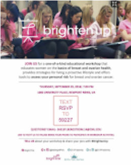
Bright Pink Workshop 535K