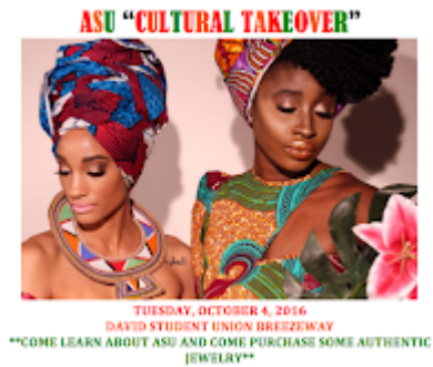
ASU Cultural Takeover 472K