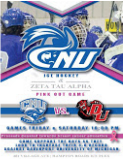
Davenport Flyer 92K