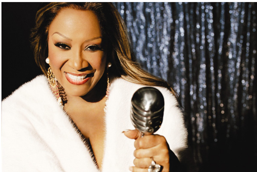
Patti LaBelle Mamma Mia and much, much more!

Now is a great time to subscribe and get the best seats in the house. Visit www.fergusoncenter.org for details.