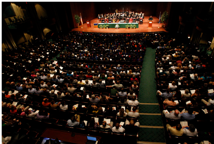
CNU faculty, honorees and their families gather in the Ferguson Center for the Arts for the Latin Honors Convocation.