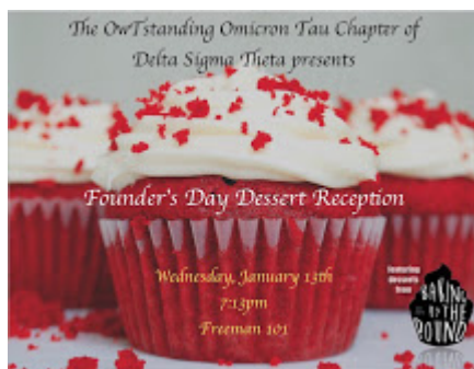
Delta Sigma Theta 146K