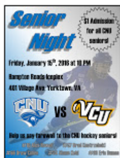
CNU Hockey Senior Night 797K