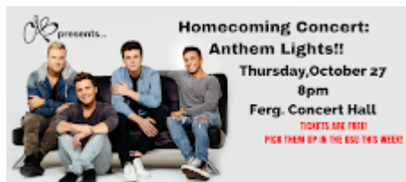
Homecoming Concert 557K