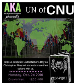
UN of CNU 98K