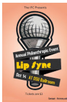
IFC LipSync.jpg 53K