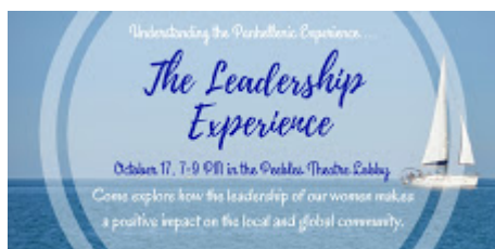
The Leadership Experience 357K