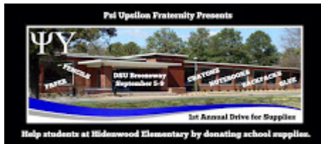
Psi Upsilon Drive.jpg 53K