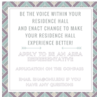
RHA Area Representative Flyer 223K