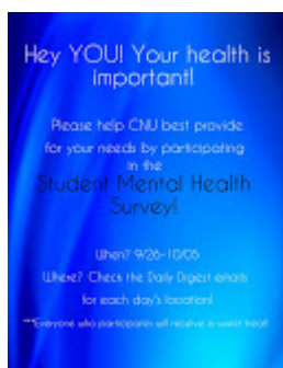
Student Mental Health Survey.jpg 306K