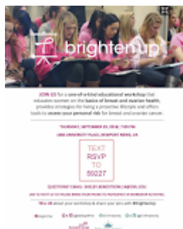
Bright Pink Workshop 535K