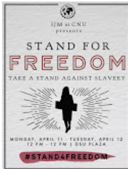
Stand for Freedom 299K