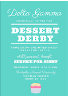
Delta Gamma's Dessert Derby 104K