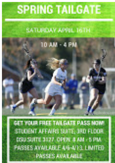
Spring Tailgate 3206K