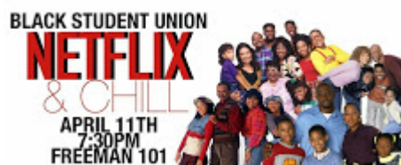
BSU Netflix and Chill 110K