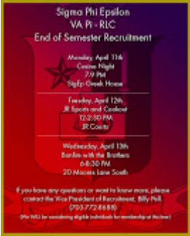
SigEp End of Semester Recruitment 59K