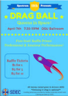
Drag Ball 149K