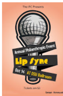
IFC LipSync.jpg 53K