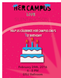
Her Campus 742K