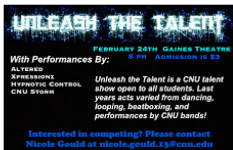
Unleash the Talent 161K