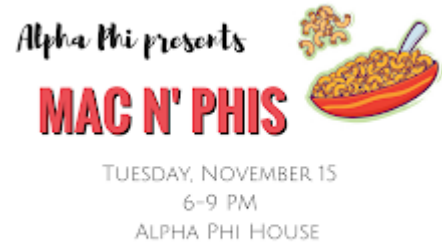
Alpha Phi 316K

all proceeds benefit the Alpha Phi foundation!