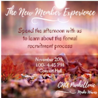
New Member Experience 896K