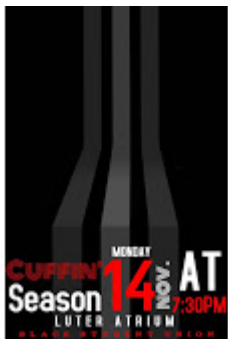
CUFFIN' Season 47K