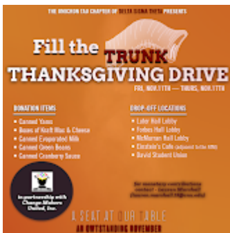
Fill the Trunk 1012K