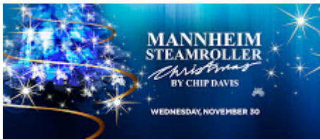
Mannheim Steamroller 236K