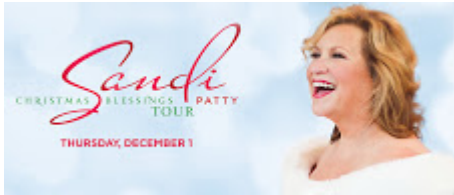
Sandi Patty 116K