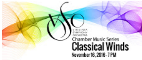
Virginia Symphony 310K