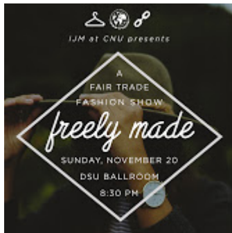
Freely Made 532K