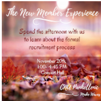
New Member Experience 896K