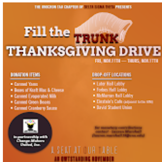
Fill the Trunk 1012K