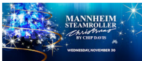
Mannheim Steamroller 236K