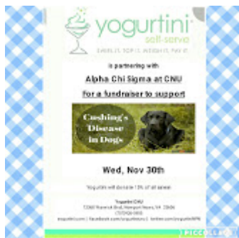
Yogurtini Fundraiser 296K