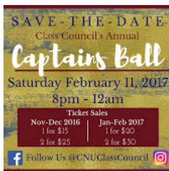
Captains Ball 374K