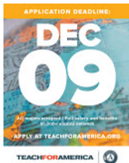
Teach for America 2821K