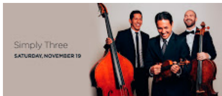
Simply Three 115K