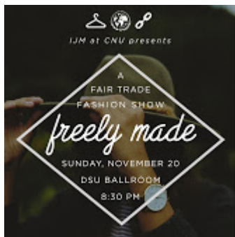
Freely Made 532K