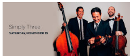
Simply Three 115K