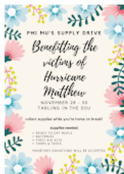
Phi Mu Supply Drive 333K